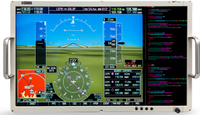
ARD24 – 24” COMPACT