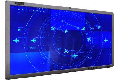
ARD32 – 32” COLLABORATIVE MISSION DISPLAY