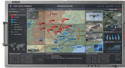
ARD27 – 27” PRIMARY OPERATOR